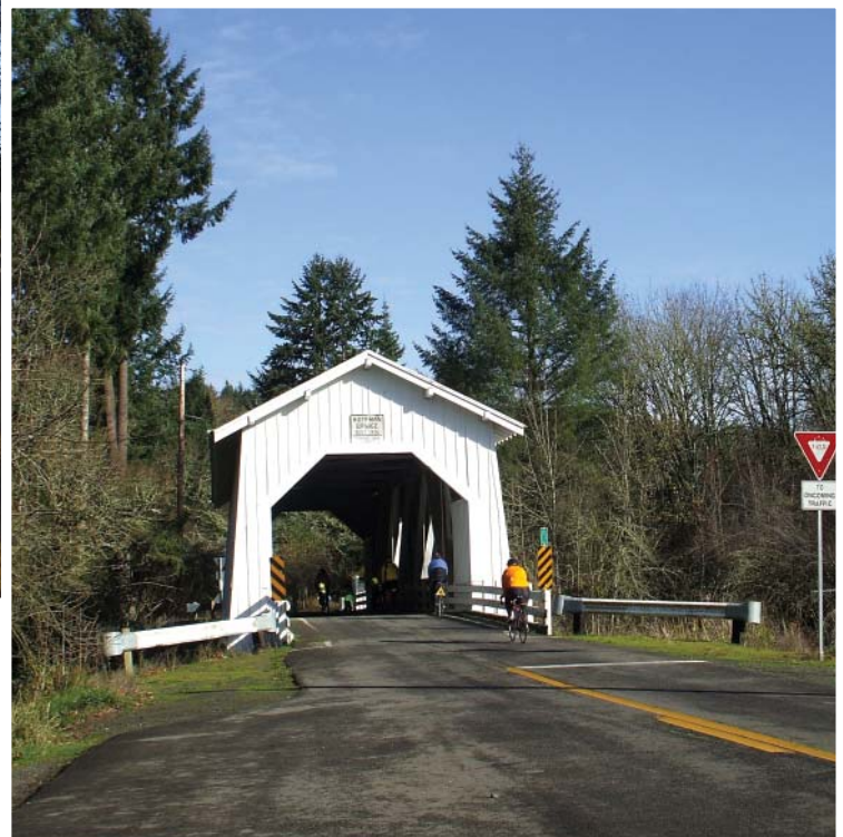
Right: Riders ride through Hoffman Bridge on Hungry Hill Road. Hoffman Bridge is a 90 foot span over Crabtree Creek. It was built in 1936