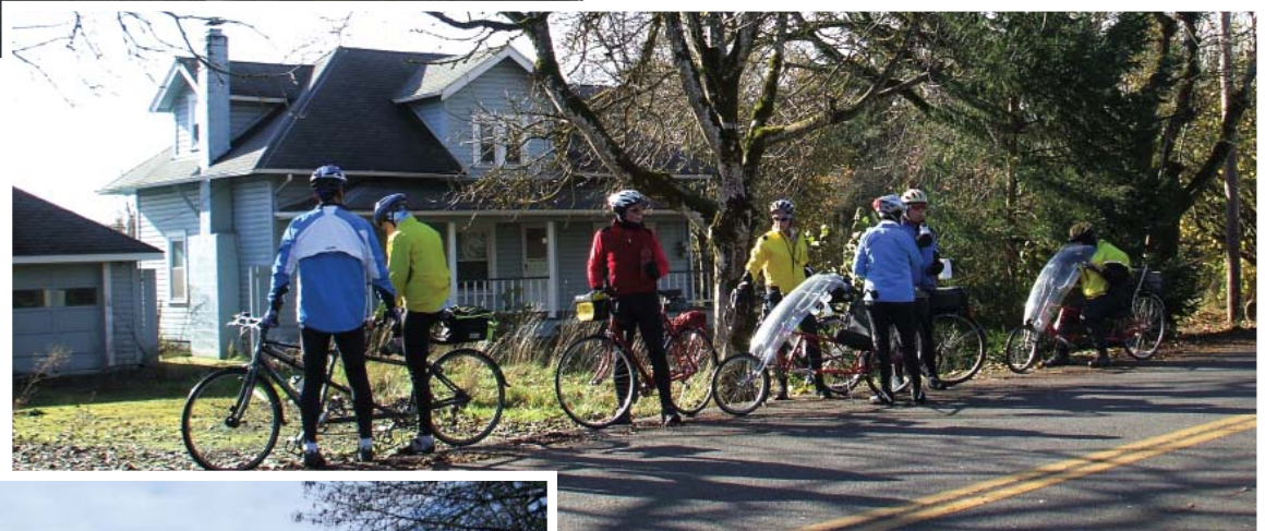
Above: Regroup just outside of Crabtree, right by the mailbox that the postman wants to reach.