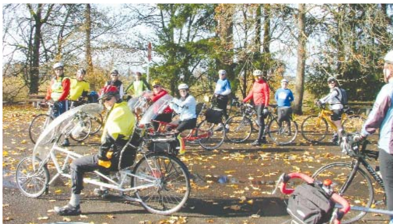
Regroup at Peoria Park.