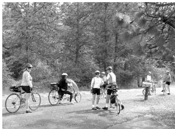
On the road to McDowell Creek Park.