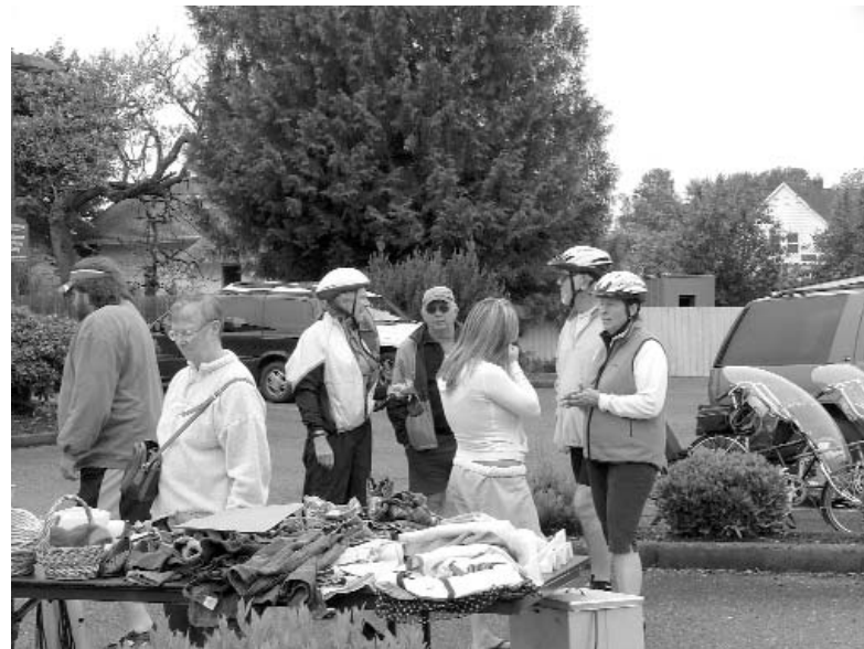
At the Lamb & Wool Fair in Scio.