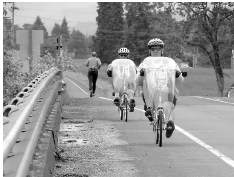
Riding over Green's Bridge on the return from Scio