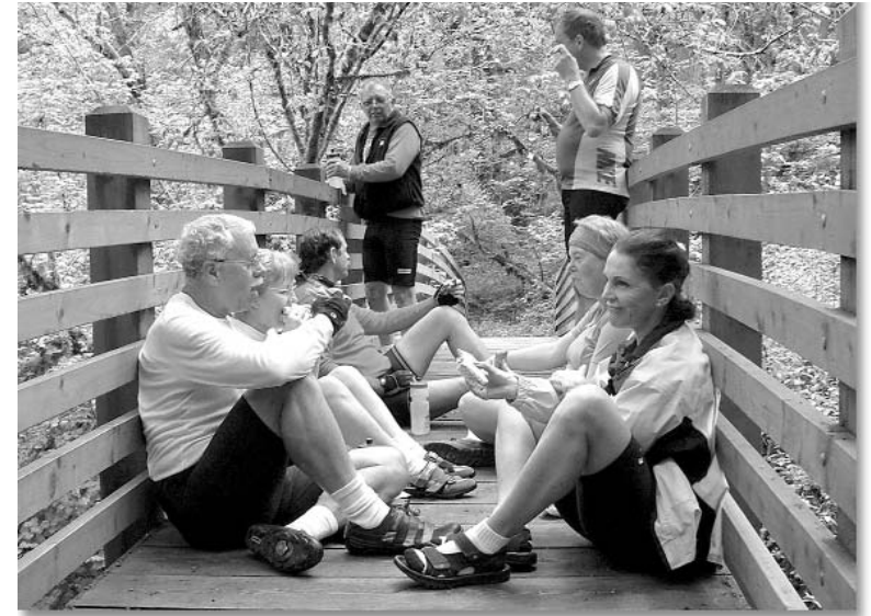
Lunch at McDowell Creek Park.